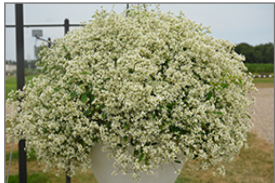
Stardust Super Flash Euphorbia in bloom