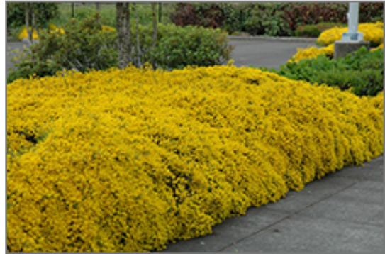
Lydia Woadwaxen in bloom