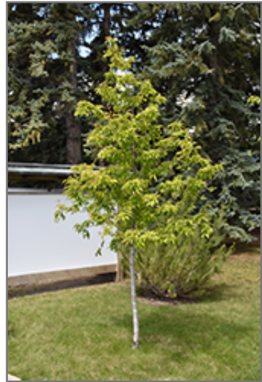
Amur Maple (tree form)