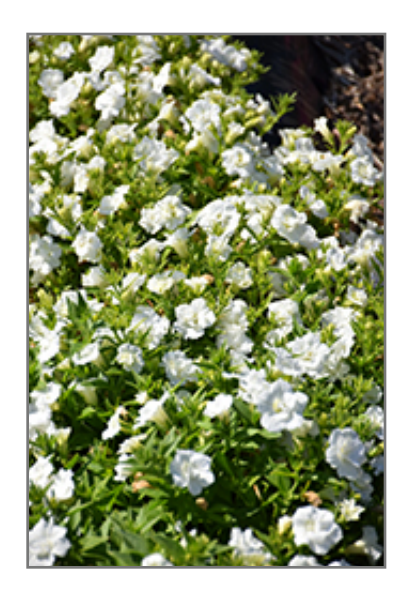
Blanket Double White Petunia in bloom