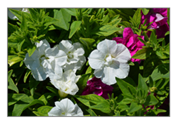
Blanket Double White Petunia flowers

www.hunnifordgardens.com Facebook @ HunnifordGardens Instagram @ hunnifordgardens