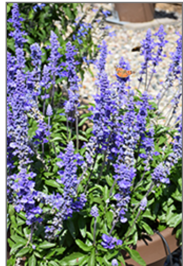
Unplugged So Blue Salvia flowers