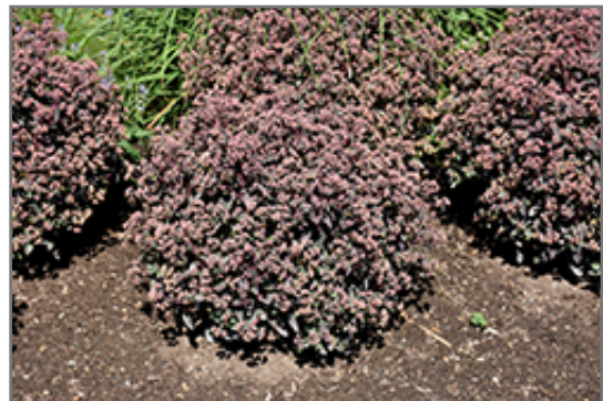
Rock 'N Grow Tiramisu Stonecrop in bloom