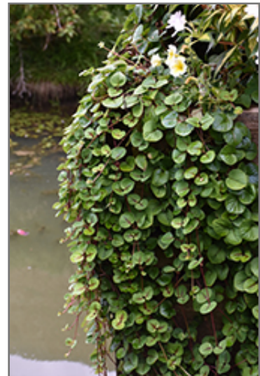
HILLIER Sunburst Moneywort