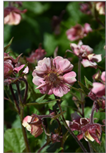
Tempo Rose Avens flowers

Tempo Rose Avens is recommended for the following landscape applications;