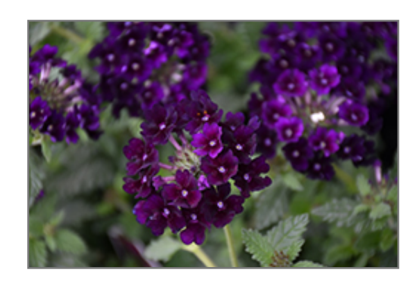
Lascar Black Velvet Verbena flowers