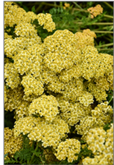
Milly Rock Yellow Terracotta Yarrow flowers