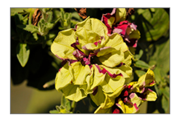
Vogue Lemon Berry Double Petunia flowers

www.hunnifordgardens.com Facebook @ HunnifordGardens Instagram @ hunnifordgardens