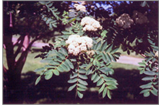
Showy Mountain Ash flowers

This tree should only be grown in full sunlight. It is very adaptable to both dry and moist locations, and should do just fine under average home landscape conditions. It is not particular as to soil type or pH. It is highly tolerant of urban pollution and will even thrive in inner city environments. This species is native to parts of North America.