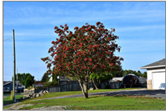
Showy Mountain Ash fruit