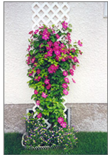
Ville de Lyon Clematis in bloom