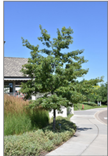
Majestic Skies Northern Pin Oak