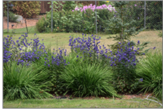
Common Monkshood in bloom

Common Monkshood will grow to be about 3 feet tall at maturity extending to 4 feet tall with the flowers, with a spread of 24 inches. It tends to be leggy, with a typical clearance of 1 foot from the ground, and should be underplanted with lower-growing perennials. The flower stalks can be weak and so it may require staking in exposed sites or excessively rich soils. It grows at a medium rate, and under ideal conditions can be expected to live for approximately 15 years. As an herbaceous perennial, this plant will usually die back to the crown each winter, and will regrow from the base each spring. Be careful not to disturb the crown in late winter when it may not be readily seen!