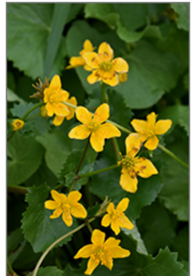
Marsh Marigold flowers