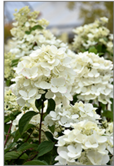
Diamond Rouge Hydrangea flowers