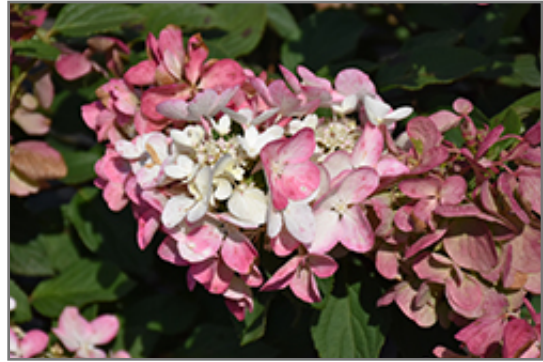
Diamond Rouge Hydrangea flowers