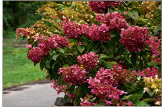
Diamond Rouge Hydrangea flowers

This shrub performs well in both full sun and full shade. It prefers to grow in average to moist conditions, and shouldn't be allowed to dry out. It is not particular as to soil type or pH. It is highly tolerant of urban pollution and will even thrive in inner city environments. Consider applying a thick mulch around the root zone in winter to protect it in exposed locations or colder microclimates. This is a selected variety of a species not originally from North America.