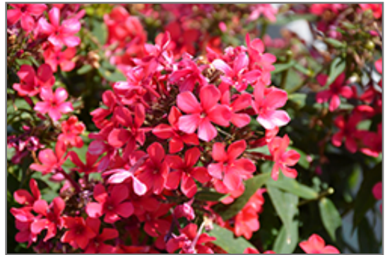
Early Red Garden Phlox flowers