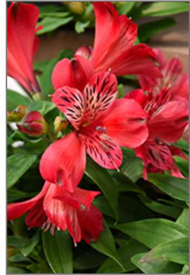
Inca Lolly Alstroemeria flowers

This impressive dwarf variety presents stunning pink-scarlet blooms with cream blotches, and dramatic deep burgundy spots; mounded, crisp green foliage provides contrast; blooms last well as cut flowers