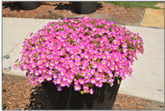
Supertunia Daybreak Charm Petunia in bloom