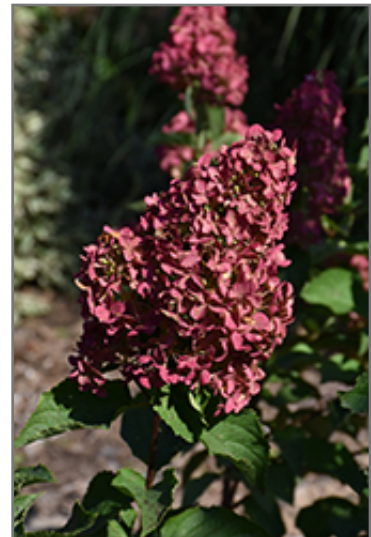
Berry White Hydrangea flowers (faded)