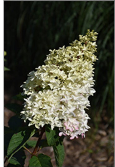
Berry White Hydrangea flowers