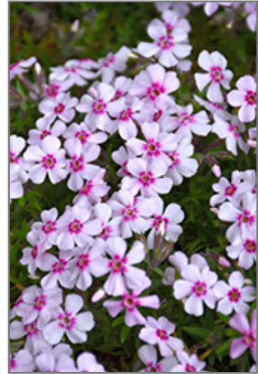
Coral Eye Moss Phlox flowers

Coral Eye Moss Phlox will grow to be only 4 inches tall at maturity, with a spread of 18 inches. When grown in masses or used as a bedding plant, individual plants should be spaced approximately 14 inches apart. Its foliage tends to remain low and dense right to the ground. It grows at a medium rate, and under ideal conditions can be expected to live for approximately 10 years. As an evergreen perennial, this plant will typically keep its form and foliage year-round.