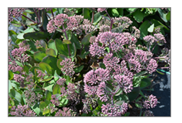
Thunderhead Stonecrop flower buds

www.hunnifordgardens.com Facebook @ HunnifordGardens Instagram @ hunnifordgardens