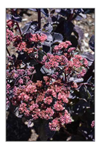
Thunderhead Stonecrop flowers