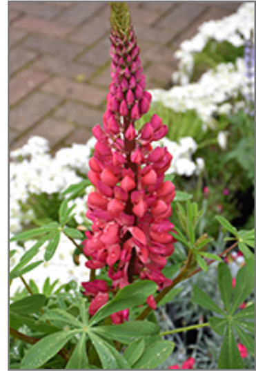
Westcountry Red Rum Lupine flowers