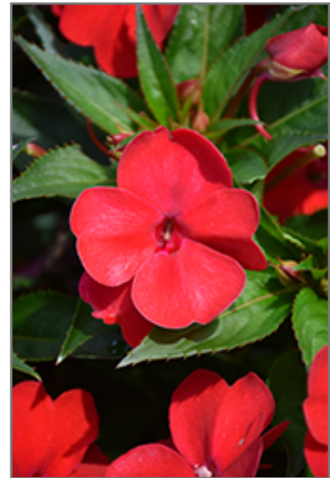
SunPatiens Vigorous Red Impatiens flowers

SunPatiens Vigorous Red Impatiens is a fine choice for the garden, but it is also a good selection for planting in outdoor containers and hanging baskets. Because of its height, it is often used as a 'thriller' in the 'spiller-thriller-filler' container combination; plant it near the center of the pot, surrounded by smaller plants and those that spill over the edges. It is even sizeable enough that it can be grown alone in a suitable container. Note that when growing plants in outdoor containers and baskets, they may require more frequent waterings than they would in the yard or garden.