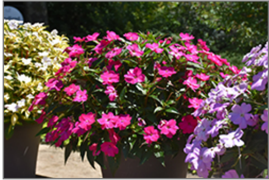
SunPatiens Vigorous Rose Pink New Guinea Impatiens in bloom

SunPatiens Vigorous Rose Pink New Guinea Impatiens is a fine choice for the garden, but it is also a good selection for planting in outdoor containers and hanging baskets. Because of its height, it is often used as a 'thriller' in the 'spiller-thriller-filler' container combination; plant it near the center of the pot, surrounded by smaller plants and those that spill over the edges. It is even sizeable enough that it can be grown alone in a suitable container. Note that when growing plants in outdoor containers and baskets, they may require more frequent waterings than they would in the yard or garden.