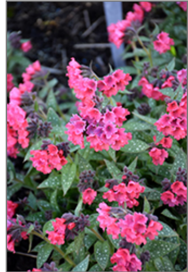
Shrimps On The Barbie Lungwort flowers

This is a relatively low maintenance plant, and should be cut back in late fall in preparation for winter. It is a good choice for attracting bees, butterflies and hummingbirds to your yard, but is not particularly attractive to deer who tend to leave it alone in favor of tastier treats. It has no significant negative characteristics.