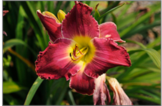
Blood Sweat And Tears Daylily flowers