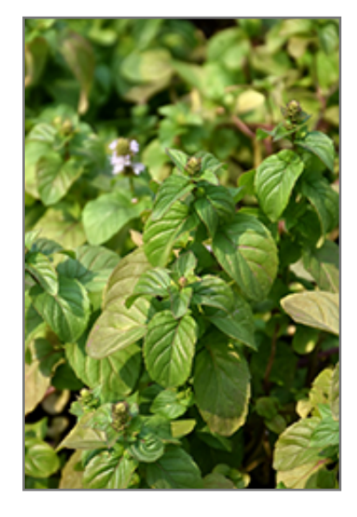
Orange Mint foliage

8845 Aquarius Rd Prince George, BC V2K 5K1