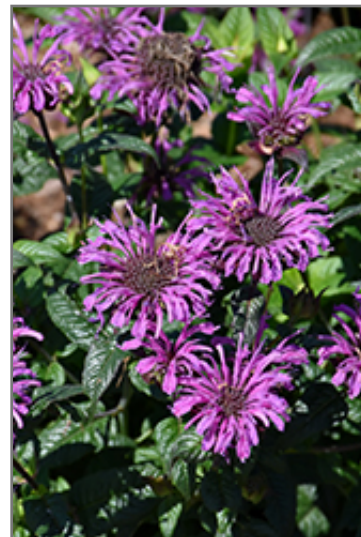
Upscale Lavender Taffeta Beebalm flowers