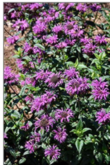
Upscale Lavender Taffeta Beebalm flowers