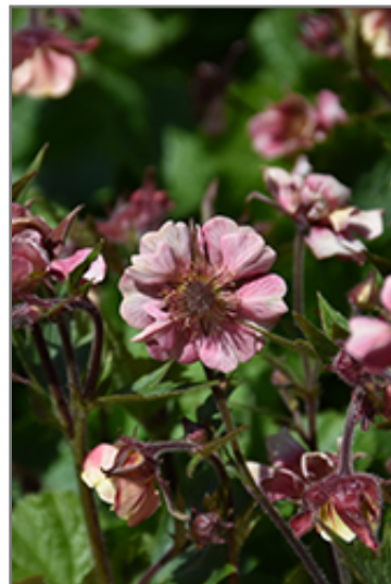
Tempo Rose Avens flowers

Tempo Rose Avens is recommended for the following landscape applications;