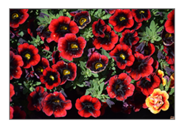
Cha-Cha Red Kiss Calibrachoa flowers