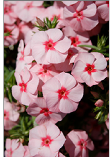
Gisele Light Pink+Eye Phlox flowers

Gisele Light Pink+Eye Phlox is recommended for the following landscape applications;