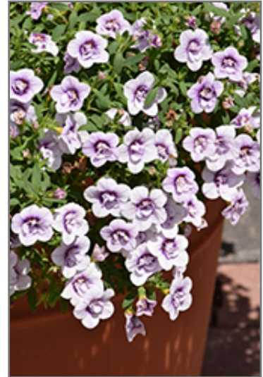
Superbells Double Twilight Calibrachoa flowers