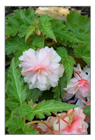
Double Delight Appleblossom Begonia flowers

Double Delight Appleblossom Begonia is recommended for the following landscape applications;