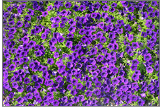
Supertunia Mini Vista Ultramarine Petunia flowers