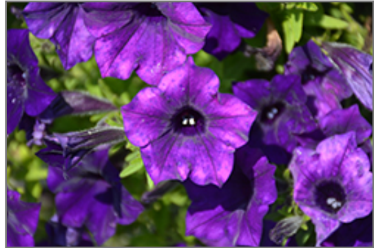
Supertunia Mini Vista Ultramarine Petunia flowers

Supertunia Mini Vista Ultramarine Petunia is a dense herbaceous annual with a trailing habit of growth, eventually spilling over the edges of hanging baskets and containers. Its medium texture blends into the garden, but can always be balanced by a couple of finer or coarser plants for an effective composition.