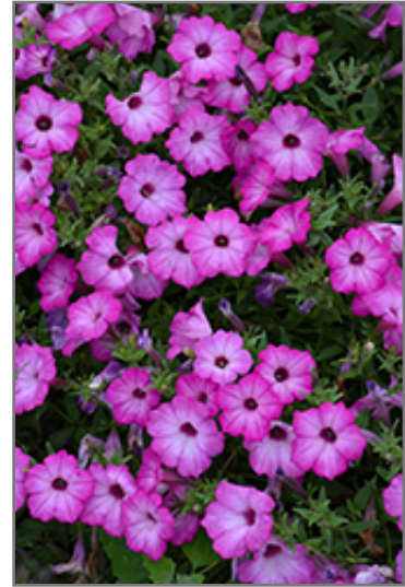
Supertunia Tiara Pink Petunia flowers

This plant will require occasional maintenance and upkeep. Trim off the flower heads after they fade and die to encourage more blooms late into the season. It is a good choice for attracting butterflies and hummingbirds to your yard, but is not particularly attractive to deer who tend to leave it alone in favor of tastier treats. It has no significant negative characteristics.