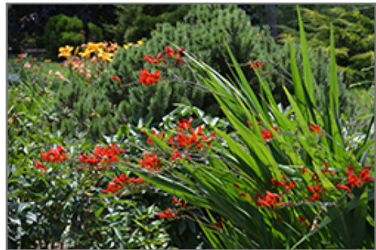
Lucifer Crocosmia in bloom