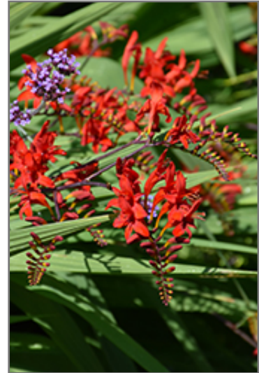
Lucifer Crocosmia flowers

Lucifer Crocosmia is recommended for the following landscape applications;