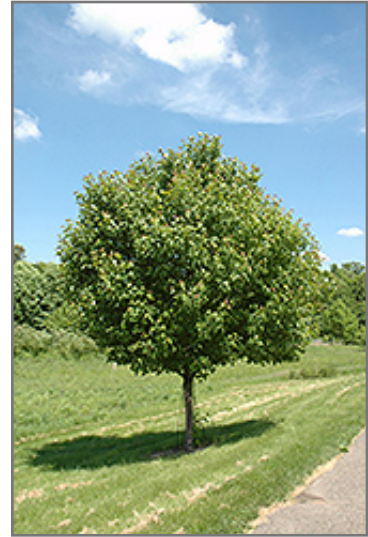
Northwood Red Maple

This tree should only be grown in full sunlight. It is quite adaptable, preferring to grow in average to wet conditions, and will even tolerate some standing water. It is not particular as to soil type, but has a definite preference for acidic soils, and is subject to chlorosis (yellowing) of the foliage in alkaline soils. It is somewhat tolerant of urban pollution. This is a selection of a native North American species.