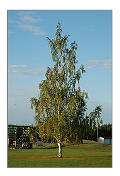
Cutleaf Weeping Birch

www.hunnifordgardens.com Facebook @ HunnifordGardens Instagram @ hunnifordgardens